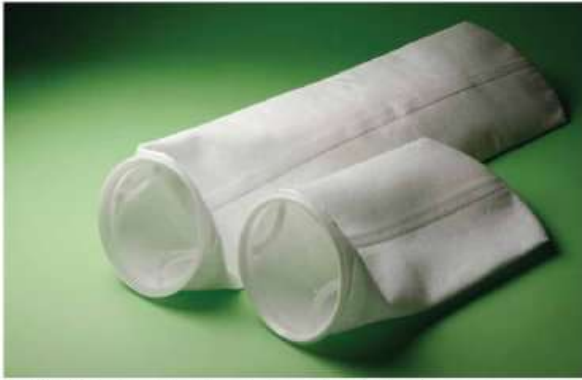
The UNIBAG filter is available in two sizes, two media material and two ring material options.